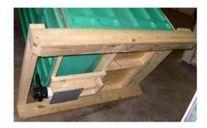
SJDV 450 – Under-Section Dump Assembly