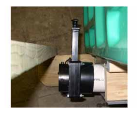
Rear View Of Dump Valve With Cap